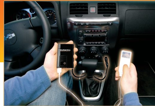
Portable power in your vehicle